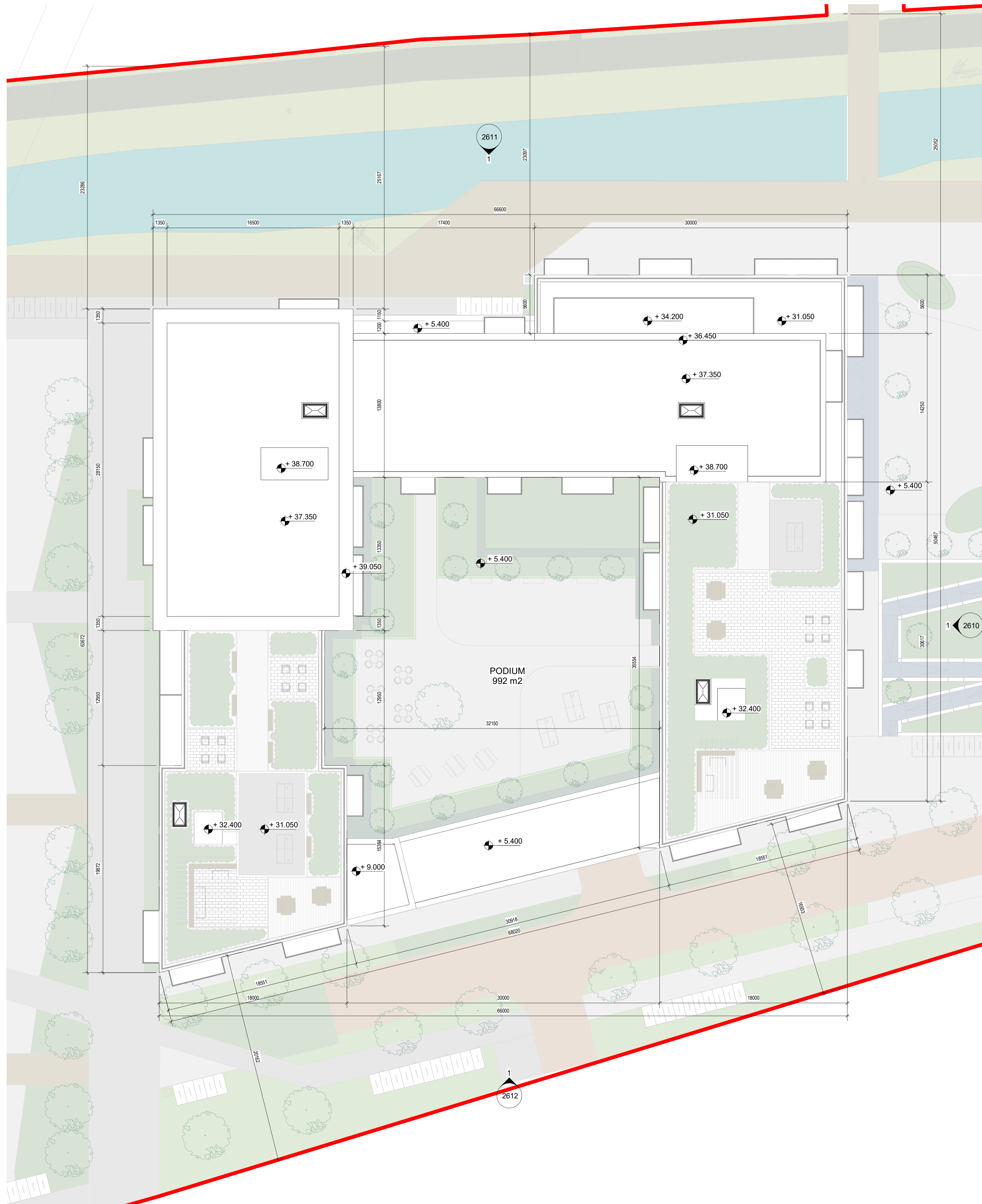
1 PLAN - BLOCK F - LEVEL ROOF 1 : 200

— SITE OUTLINE RED — LANDS IN APPLICANT'S OWNERSHIP